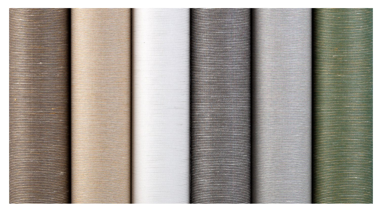
NB: The portrayed colours may differ from reality.